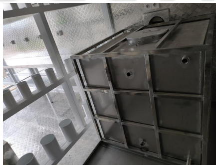
- Water Tank -