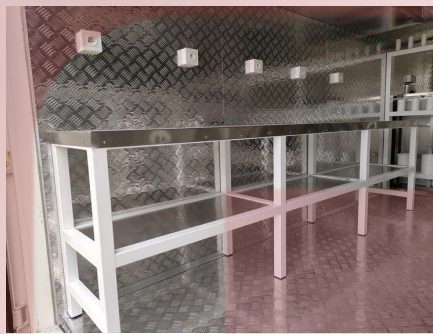
- Workbench -