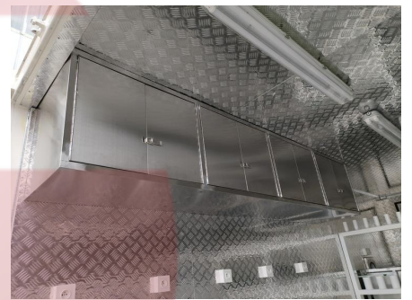
- Cabinets -