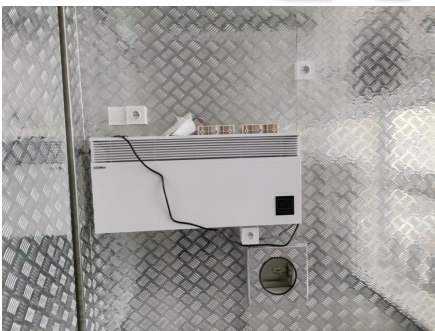
- Fan Heater -