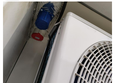
- External Power Hookups -