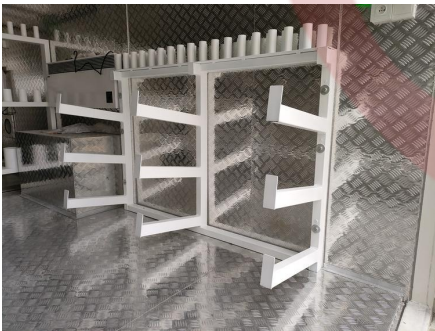
- Shelf -