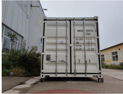
- Door -