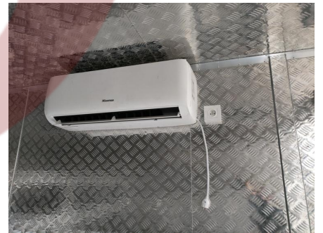
- Air Conditioner -