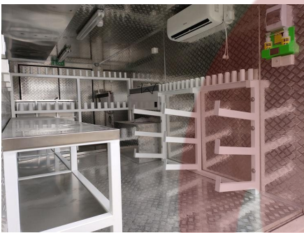
- Inside -